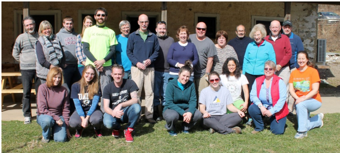
The WQVC volunteers outside the Riverlands Research and Education Center